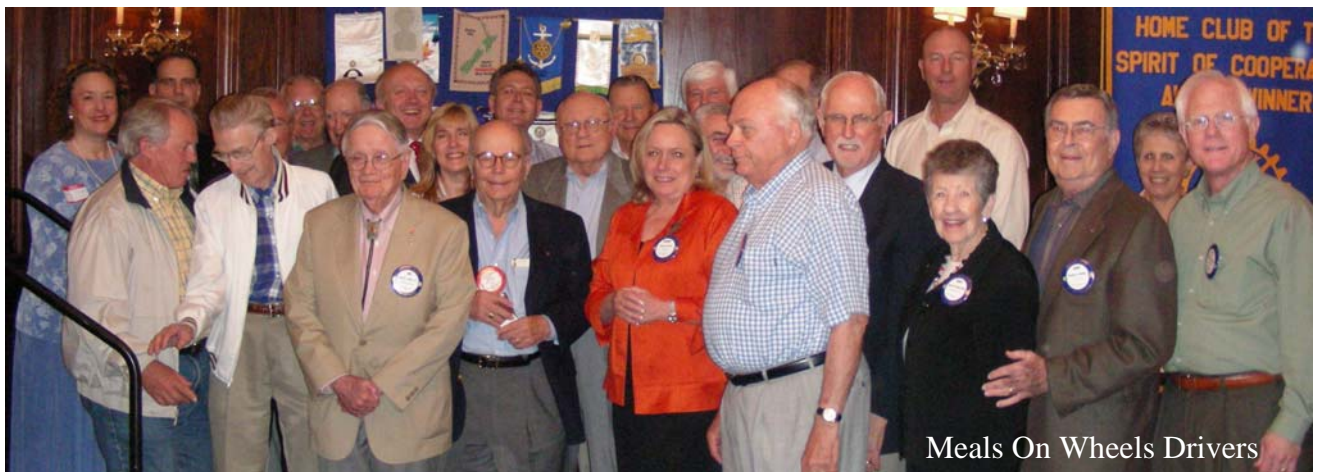
Meals On Wheels Drivers