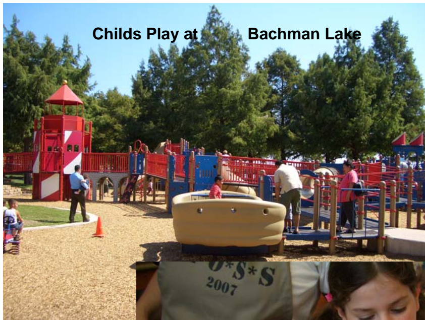
Childs Play at Bachman Lake