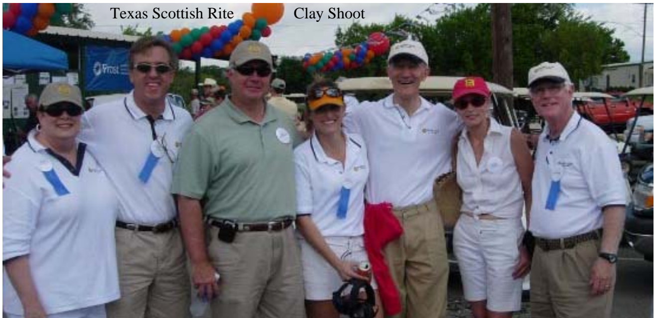
Texas Scottish Rite Clay Shoot