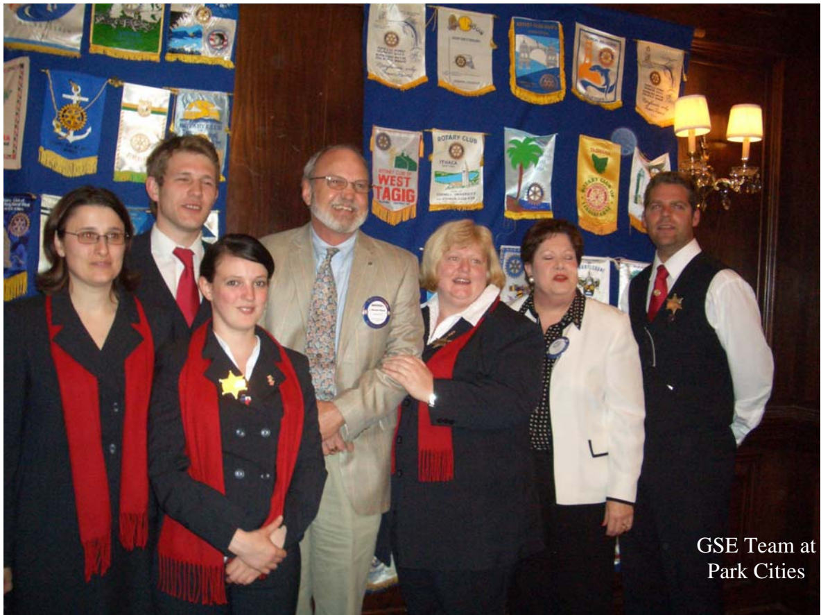
GSE Team at Park Cities