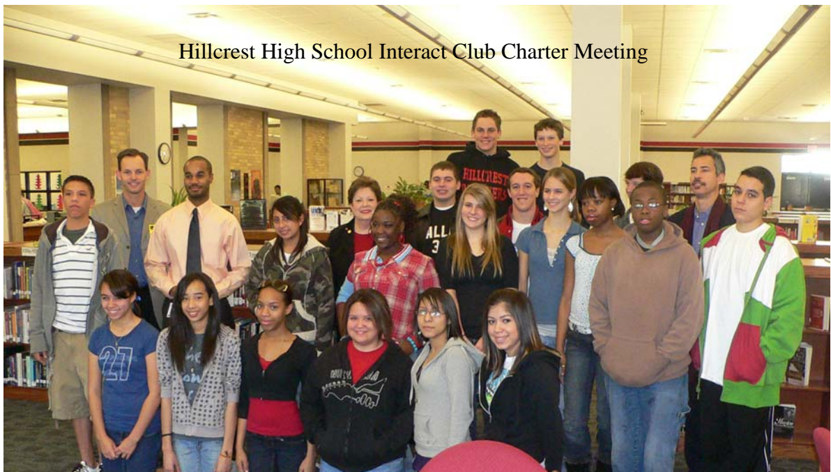
Hillcrest High School Interact Club Charter Meeting