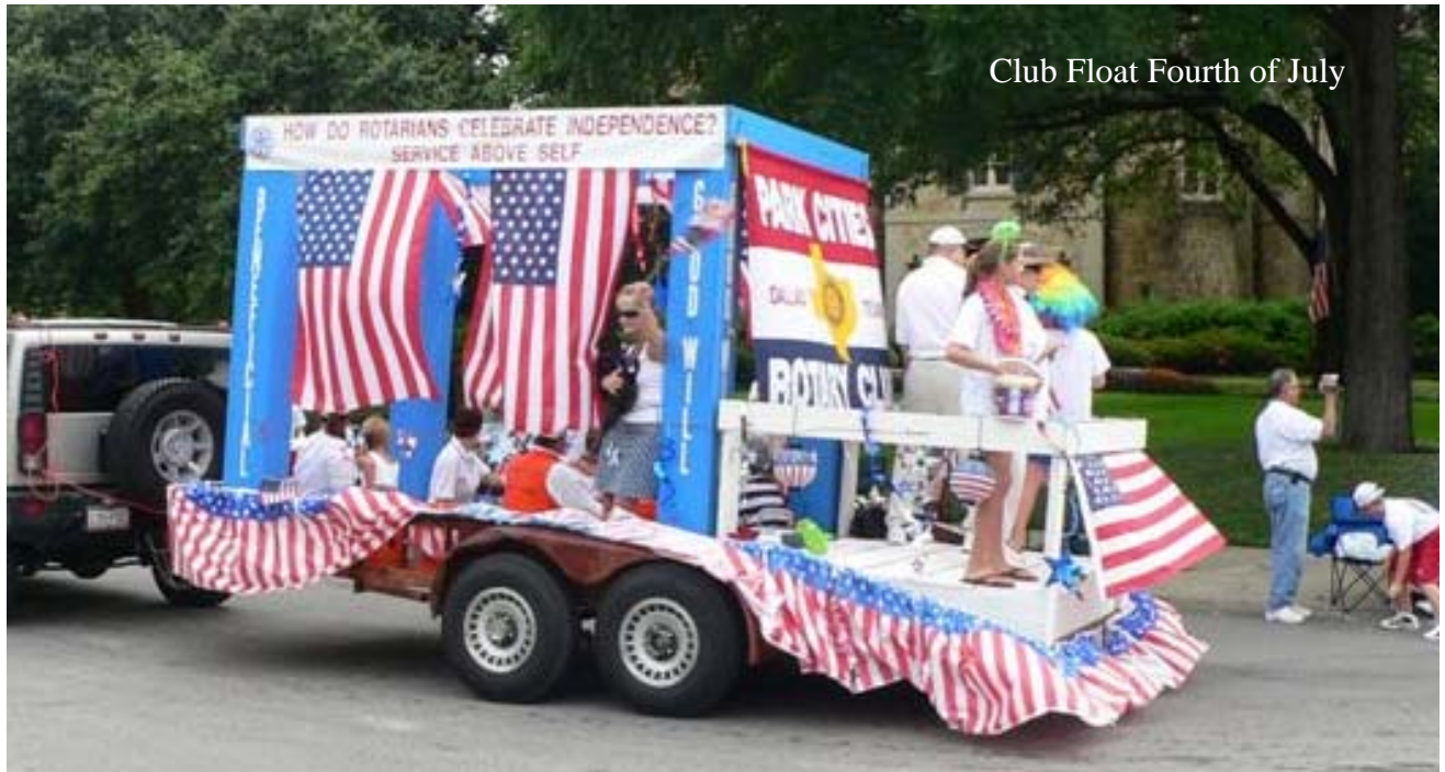
Club Float Fourth of July