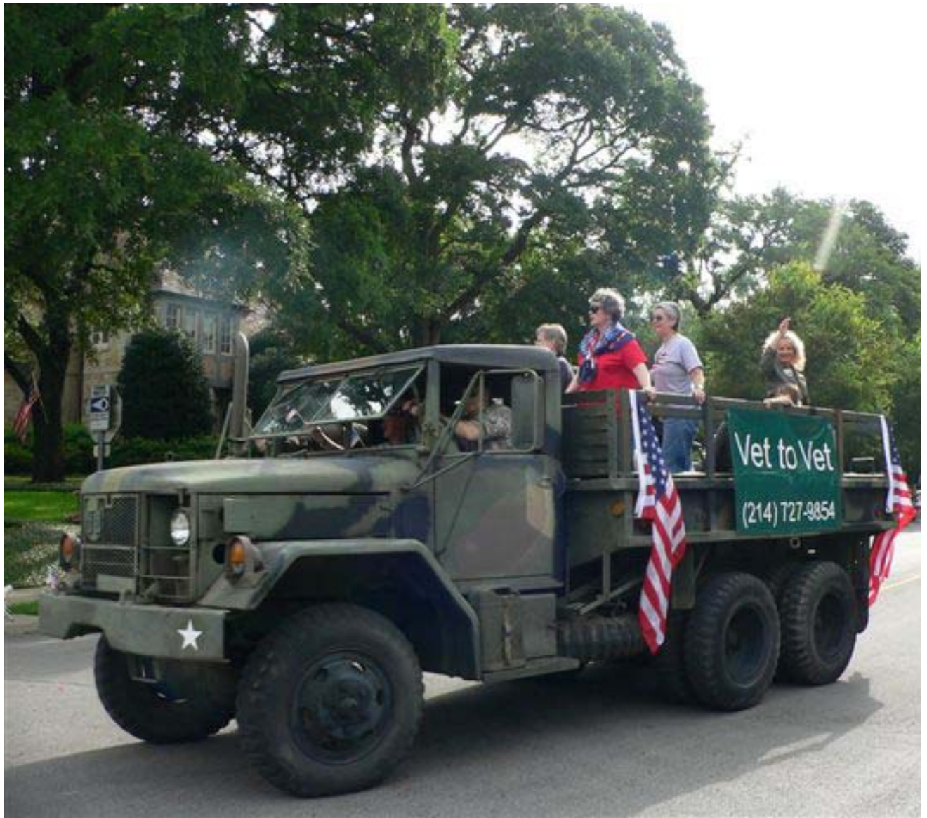
Vet to Vet in Fourth of July Parade