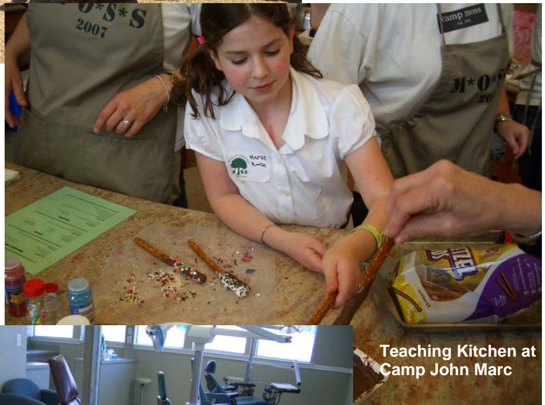
Teaching Kitchen at Camp John Marc