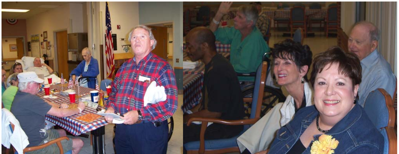
Vet to Vet Bingo at Veterans Hospital